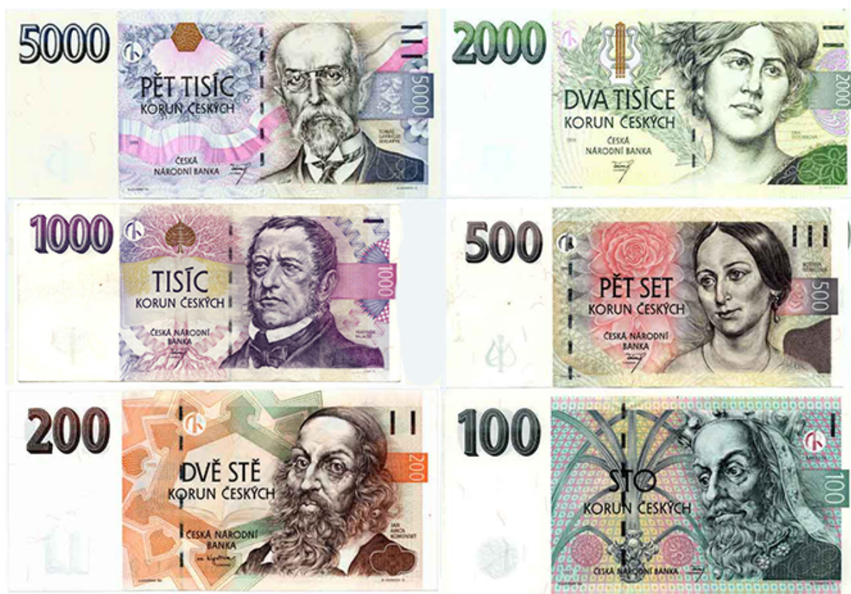
Fig. 1. How Czech current banknotes looks like. Beware of fraud.

In addition there are the following notes: 100, 200, 500, 1,000, 2,000 and 5,000 crowns. Beware of currency exchange tellers which promise rates that are too good to be true – they will charge exorbitant exchange fees. According to Czech National Bank, 1 USD = 23.022 CZK , 1 EUR = 25.570 CZK , more currencies you can find here . Here is the picture how Czech crown banknotes look like. All major credit and debit cards are widely accepted at shops, hotels, banks and ATM machines. Euros are usually not accepted. Therefore, we recommend having some cash in Czech Crowns. You can exchange cash in banks (usually some small fee is applied) or at exchange office (where exchange rates can vary) or use an ATM machine to withdraw – there are a lot of them in the cities.